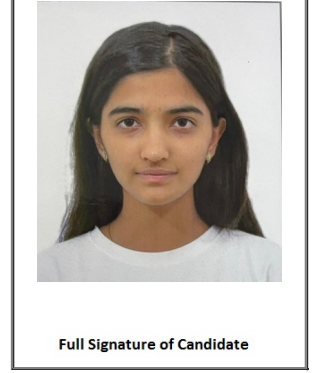
Full Signature of Candidate

Note 1:=>Candidates must check the date-sheet on P.U. Website http://exams.puchd.ac.in/datesheet.php before appearing in the Examination