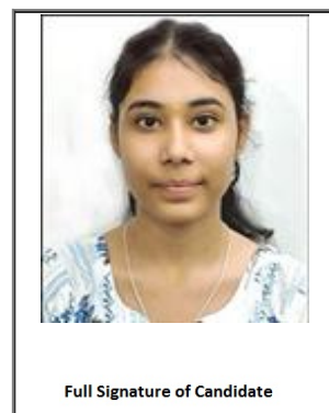
Full Signature of Candidate

Note 1:=>Candidates must check the date-sheet on P.U. Website http://exams.puchd.ac.in/datesheet.php before appearing in the Examination